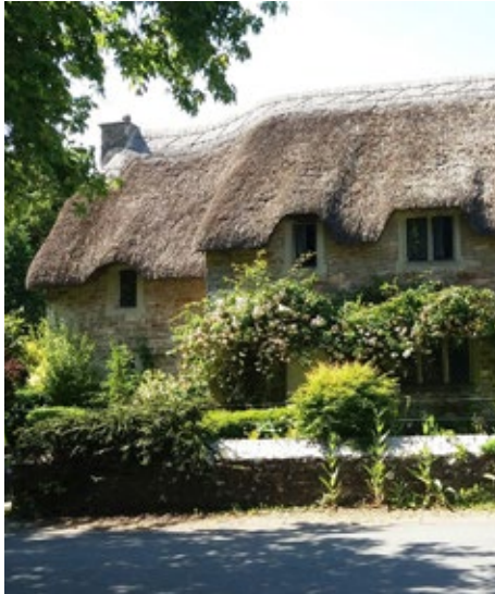
Cottage at Merthyr Mawr

There is a newly refurbished church hall to oversee and the new incumbent will also be expected to be a trustee of the Blandy Trust, which administers a local building where the Community Council meet.