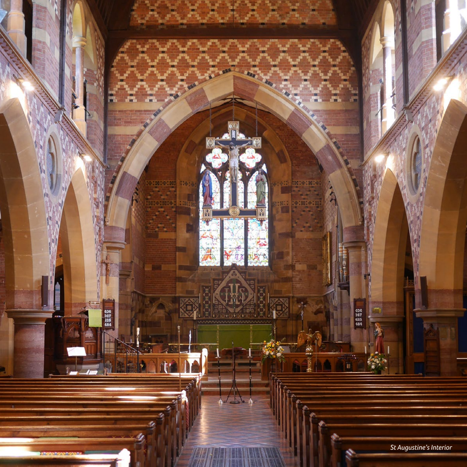
St Augustine's Interior