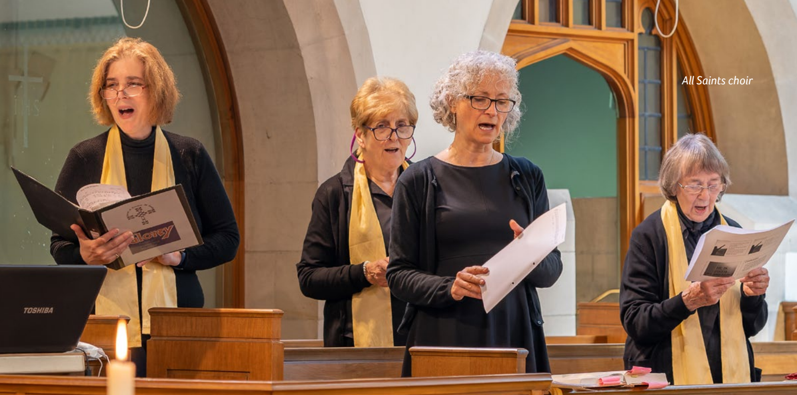
All Saints choir