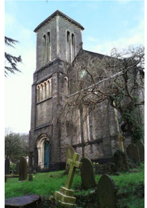
St Mary's Church, Glyntaff

Historically the daughter church of St Mary's, St Luke's is a modern church building with a Eucharistic focus and a heart for music. The Church frequently host choral concerts and fundraisers with Volante Opera Productions. The Pontypridd Foodbank has its origins here. The church has been recognised as an Eco Congregation twice. The promote fairtrade and run a weekly Snack and Chat outreach which has led to people coming to know Jesus, as well as a monthly ecumenical Messy Church. St Luke's is a congregation of 26.