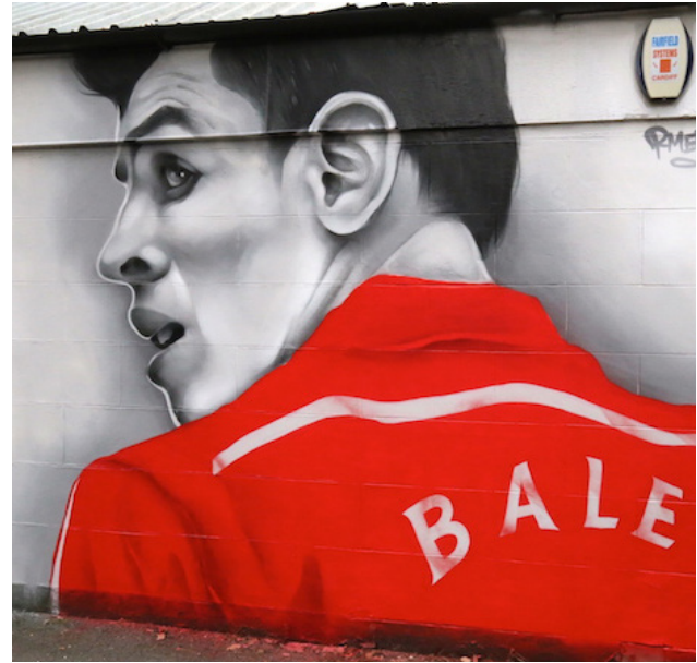
Gareth Bale mural, Whitchurch Cardiff

Inspired by the Garden Village Movement at the turn of the 20th century, Rhiwbina retains its character and integrity as a garden village which makes it a very popular place to live. The community is proud of the area's heritage and works hard to maintain it. It has a thriving village centre with a variety of independent and boutique traders, alongside two pubs, two restaurants and the popular Rhiwbina Recreation Club.