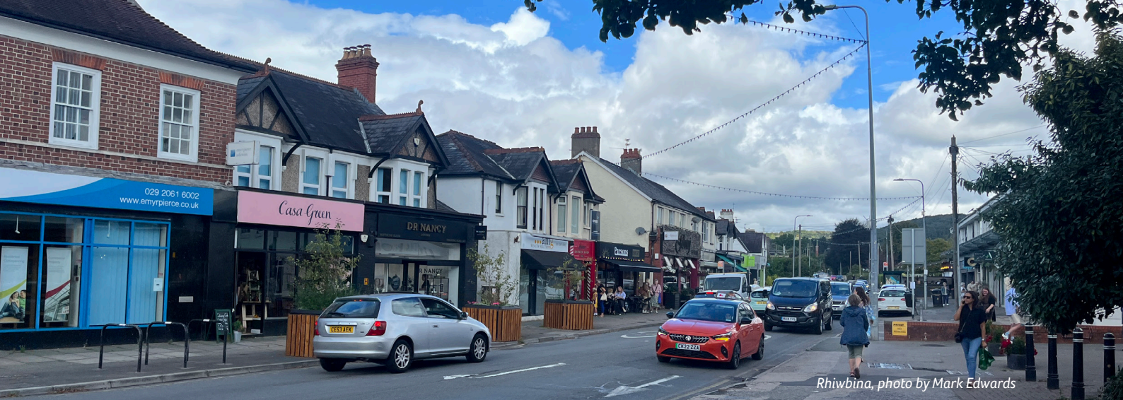
Rhiwbina