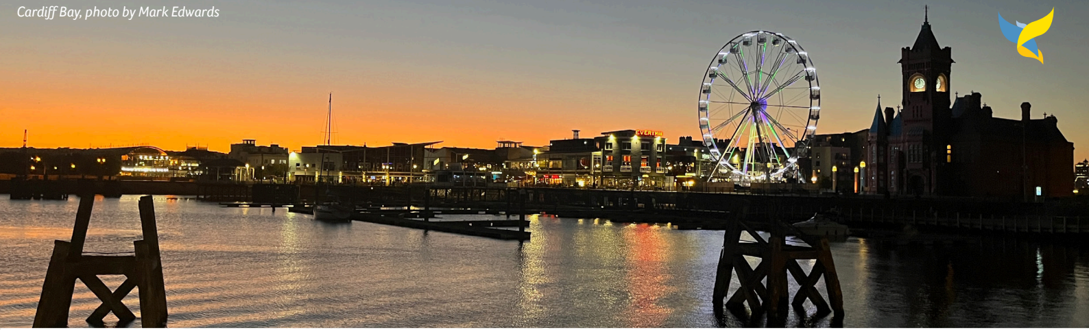
Cardiff Bay