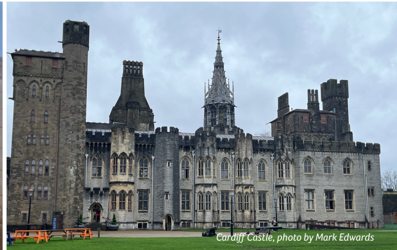
Cardiff Castle