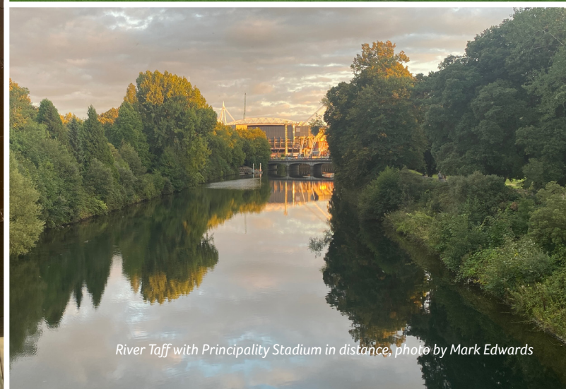
River Taff with Principality Stadium in distance